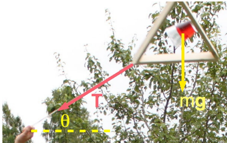
Figure 3. During a sufficiently fast rotation the surface of the liquid remains parallel to the bottom of the glass, orthogonal to the string

a glass or bottle put on a swing [1]. That experiment has also been adapted for Science Days at the Bakken amusement park in Denmark [5].