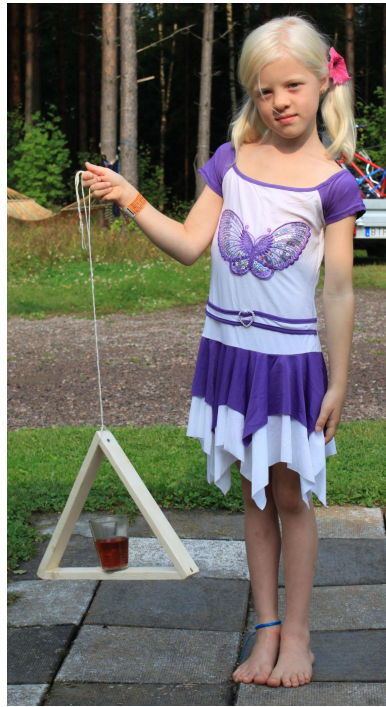
Figure 1. A glass of cordial, resting on wooden triangle on a string