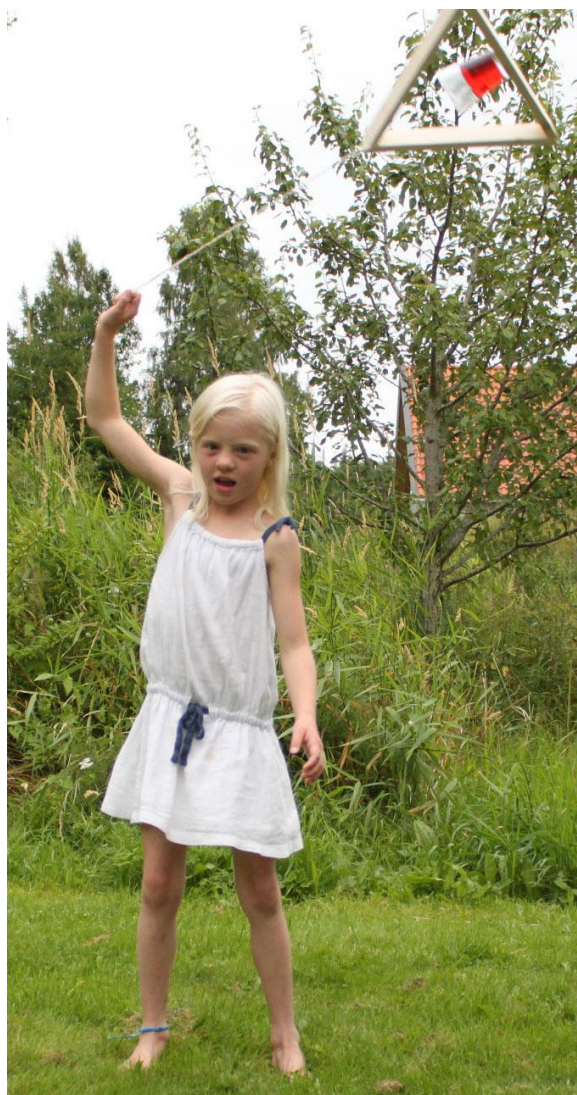
Figure 2. During rotation - and other motions - the surface of the liquid remains parallel to the bottom of the glass, orthogonal to the string

component, F_t = mg \cos \theta , leads directly to an acceleration a_t = g \cos \theta . From within the accelerating triangle, it seems like gravity has been turned off in the tangential direction. This is analogous to free fall causing an experience of weightlessness. An accelerometer measuring the vector \mathbf{a} - \mathbf{g} will show zero in the tangential direction (see e.g. [2, 3]). It is a consequence of the equivalence between inertial and gravitational mass, which has been explored e.g. in [4]